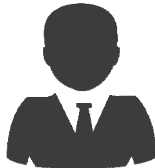
N.N. (Genius Graphics)

Developer of the algorithmic differentiating NAG Fortran compiler and core developer of TELEMAC-AD. Expert on Fortran, software design and optimisation strategies.